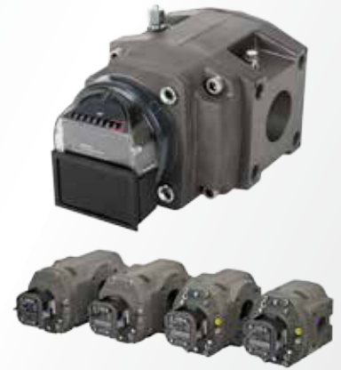
Positive Displacement Meters

FMG has added extra features to the meters in terms of increased accuracy, protection from manipulation, increased rangeability and superior performance in order to go beyond the minimum requirements of the existing standards.