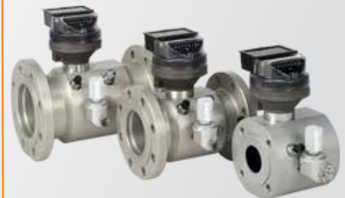
Turbine Meter Series FMT