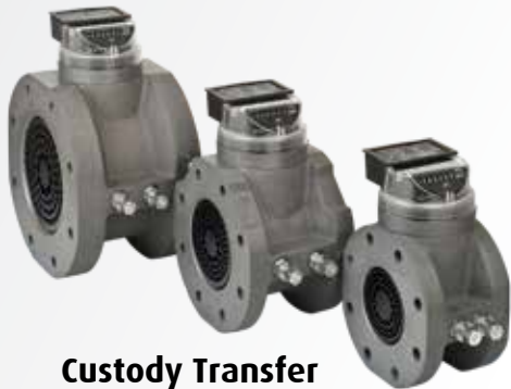
Custody Transfer Short Length Turbine Meters